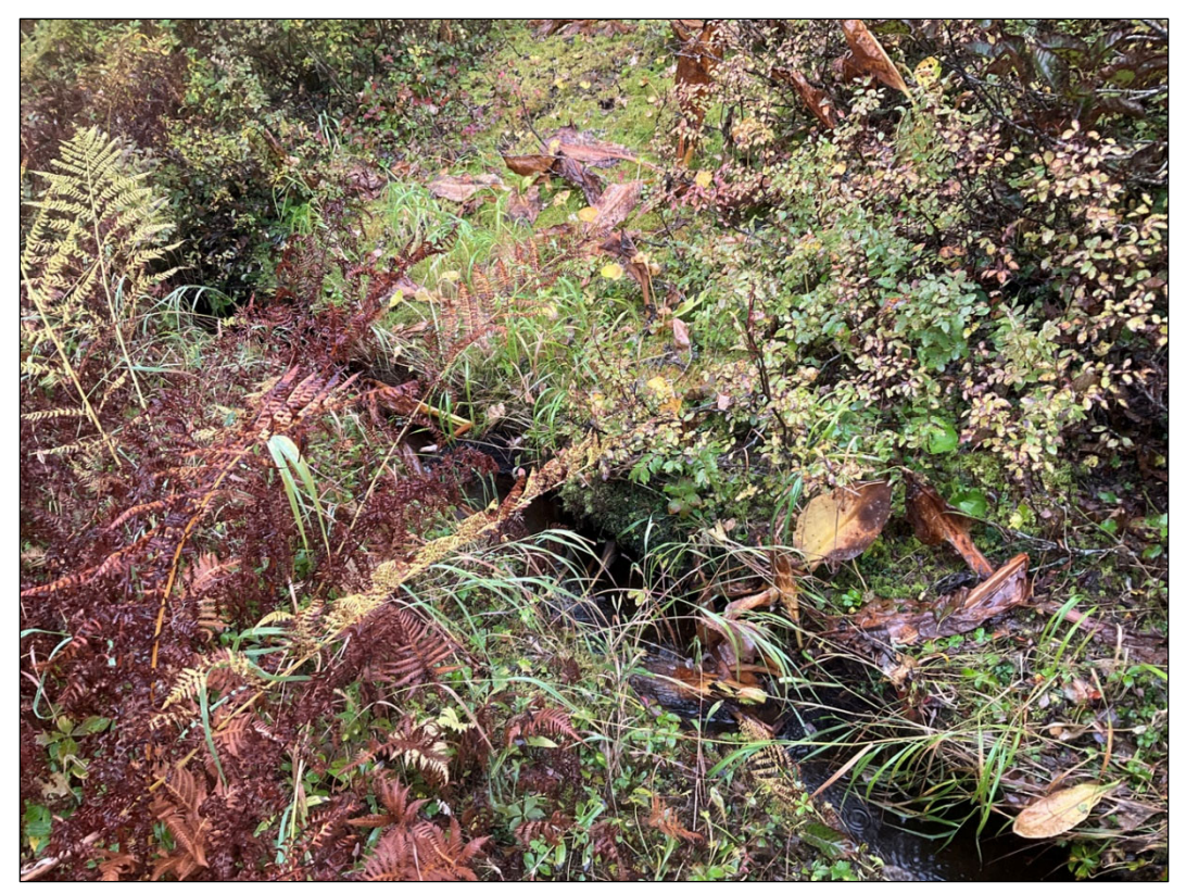
Figure 2.-Channel at waypoint 925.